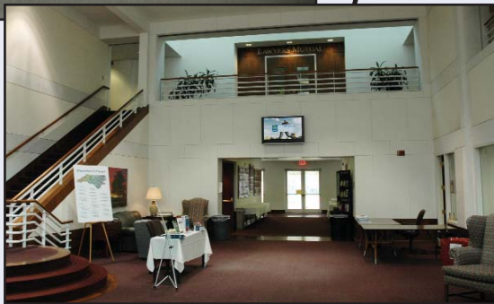
N.C. Bar Center Galleria