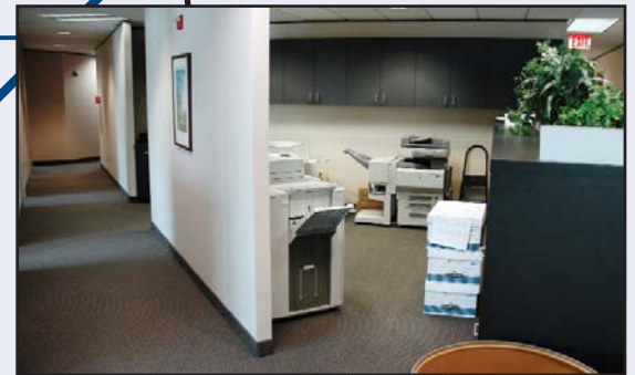
Copy/Print/Fax Work Area