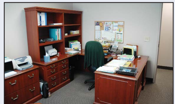
Basic Office Space

Contact Tom Purdy ( tpurdy@ncbar.org ) FAX 919-657-1585 • PHONE 1-800-662-7407 or local 919-677-0561 Additional information via NCBA Web site: www.ncbar.org