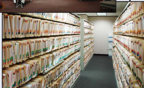
File Storage Area